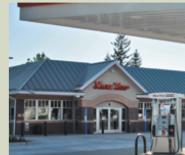
5.5 Million Guests/Week