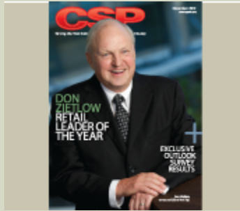
Family Owned- One Family