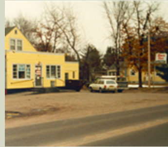
50 th Anniversary In 2015