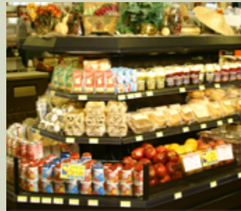
$5.6 Billion In Sales