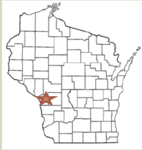
La Crosse, WI