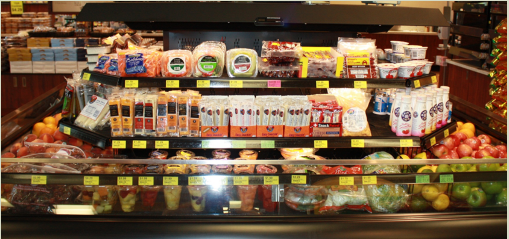
Produced Located Throughout The Store: Fresh Case – Cooler Doors – End Cap