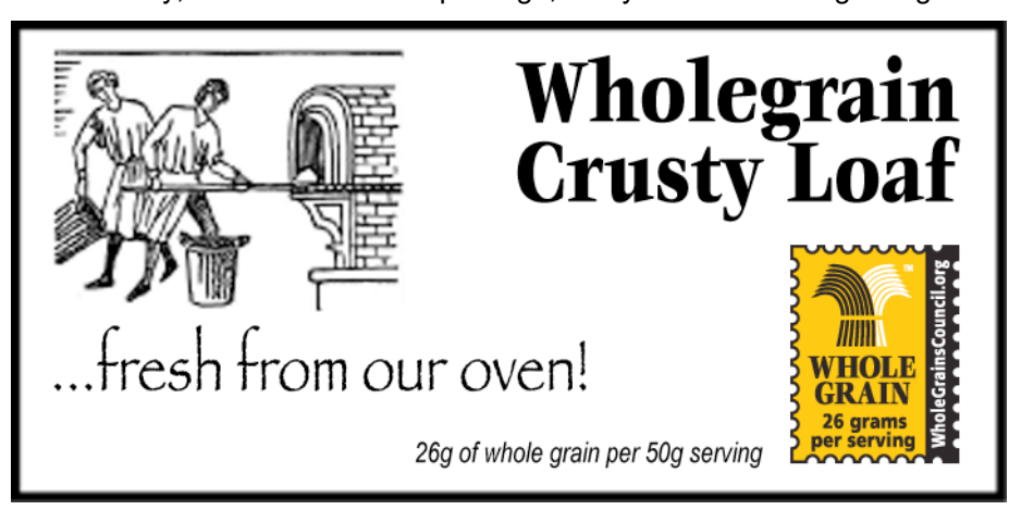
Example 2 : A loaf of unsliced bakery-department bread does not display nutritional information. You should state clearly, somewhere on the package, that you are assuming a 50g serving.