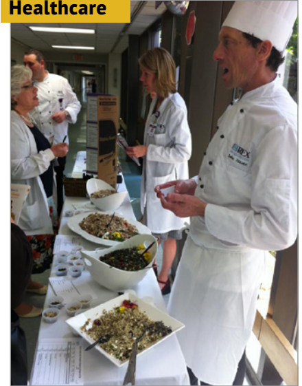
Chef Demo and RD Talk Rex Healthcare