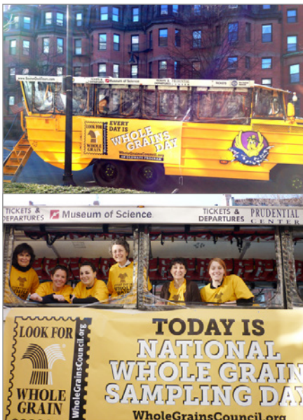
Duck Boat Sample Giveaway Whole Grains Council