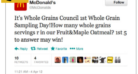
Twitter Giveaway McDonald's