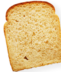
1 slice bread