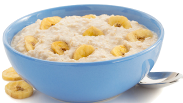
1 cup oatmeal = _____ servings