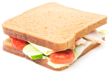
Sandwich = _____ servings

How many servings of whole grain would you get, if you ate each of the foods below?