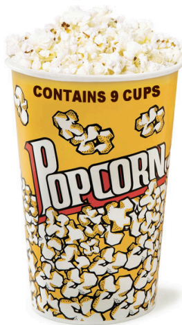
Movie Popcorn = _____ servings