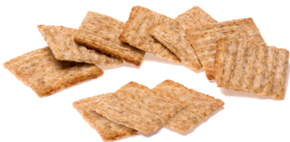
10 crackers = _____ servings