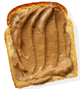
Toast = _____ servings