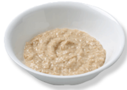
1/2 cup of oatmeal