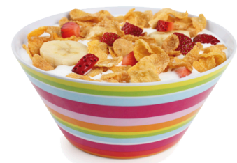
2 cups cereal = _____ servings