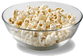
3 cups of popcorn

Each of these equals one MyPlate serving of whole grain.