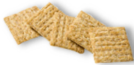
5 whole wheat crackers