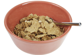
1 cup of cereal

How many servings of whole grain would you get, if you ate each of the foods below?