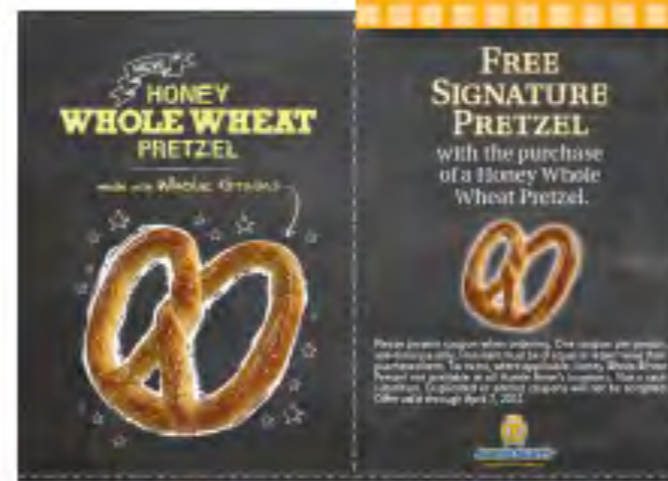
Buy One, Get One Free offer Auntie Anne's