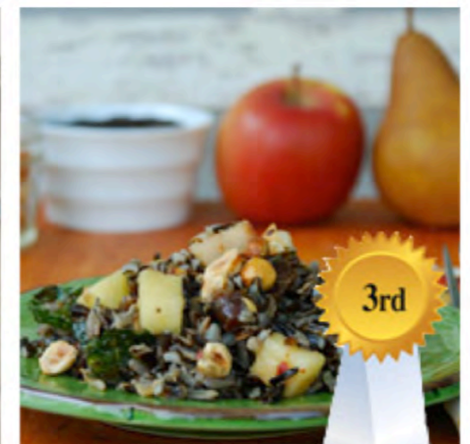
tiny farmhouse kitchen. garden. home.