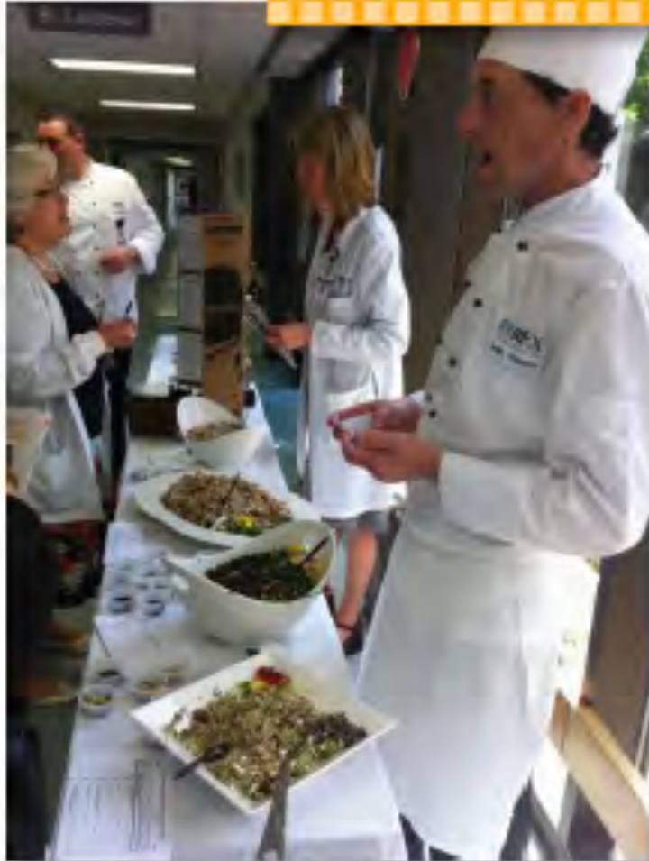
Chef Demo and RD Talk Rex Healthcare