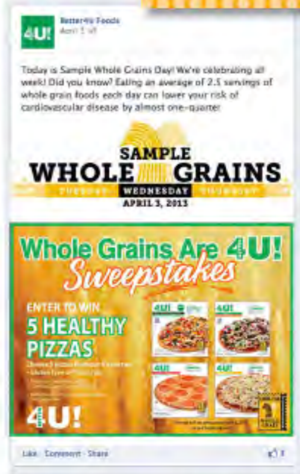
Facebook Sweepstakes Better4U Foods