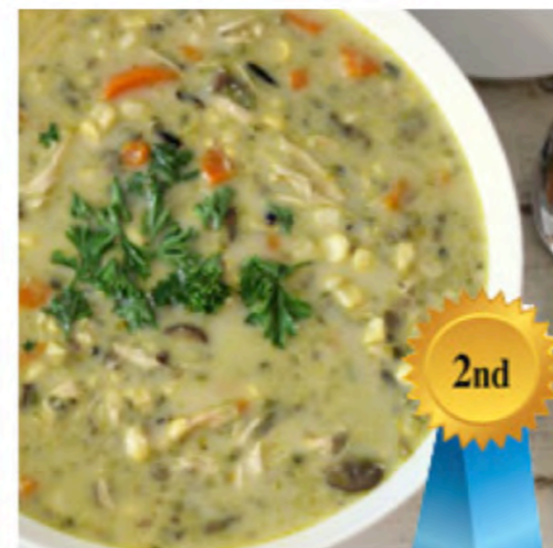
peanut butter & PEPPERS