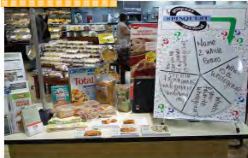
Quiz Game, Whole Grain Prizes Giant Eagle Supermarkets