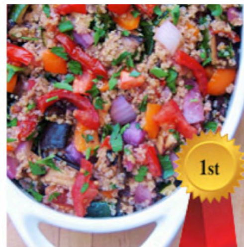
Bobbi's Kozy Kitchen