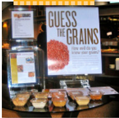
Guess the Grains Sampling Bar Compass NA cafeteria