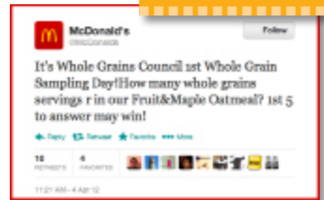
Twitter Giveaway McDonald's