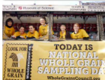
Duck Boat Sample Give-away Whole Grains Council