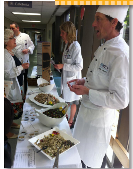
Chef Demo and RD Talk Rex Healthcare