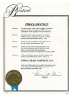
Mayoral Proclamation City of Boston