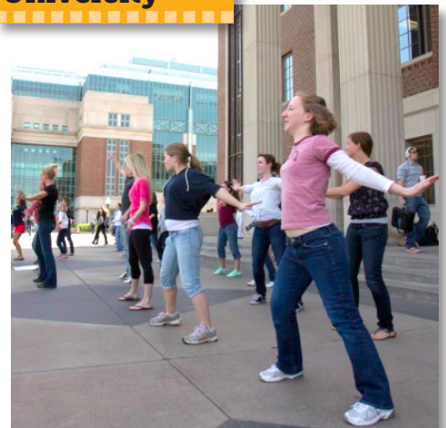
U MN Campus Flash Mob Grains for Health Foundation