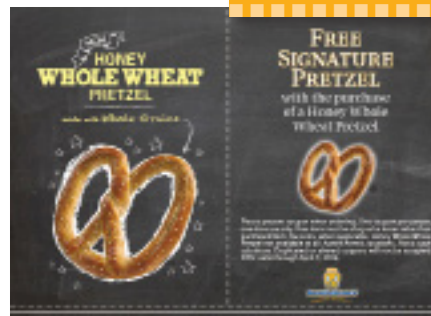
Buy One, Get One Free offer Auntie Anne's