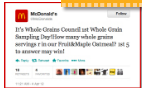
Twitter Giveaway McDonald's