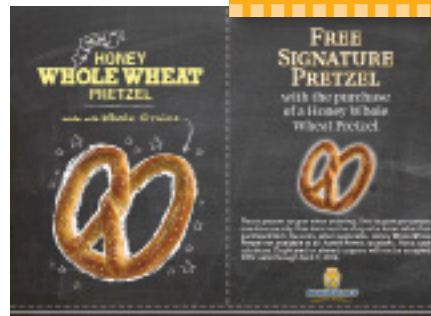
Buy One, Get One Free offer Auntie Anne's