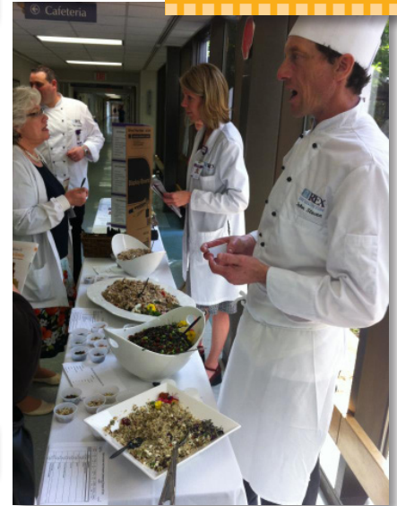
Chef Demo and RD Talk Rex Healthcare