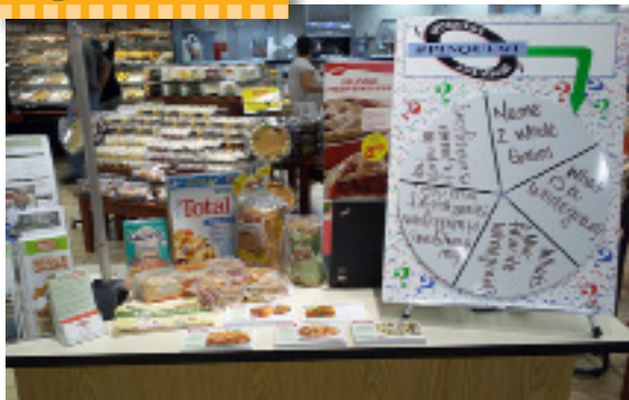
Quiz Game, Whole Grain Prizes Giant Eagle Supermarkets