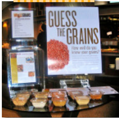
Guess the Grains Sampling Bar Compass NA cafeteria