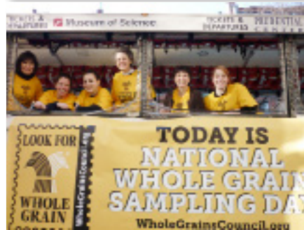
Duck Boat Sample Give-away Whole Grains Council