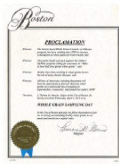
Mayoral Proclamation City of Boston