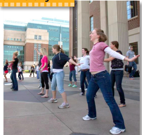
U MN Campus Flash Mob Grains for Health Foundation