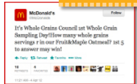
Twitter Giveaway McDonald's