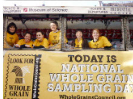
Duck Boat Sample Give-away Whole Grains Council