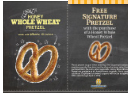
Buy One, Get One Free offer Auntie Anne's