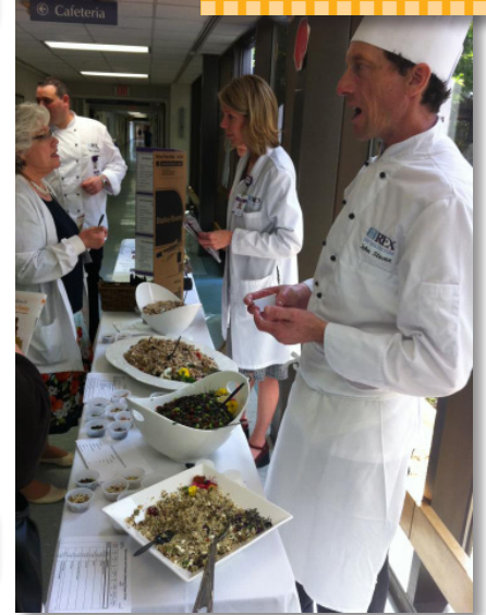
Chef Demo and RD Talk Rex Healthcare