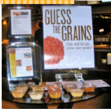
Guess the Grains Sampling Bar Compass NA cafeteria