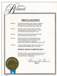
Mayoral Proclamation City of Boston