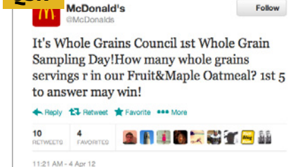
Twitter Giveaway McDonald's