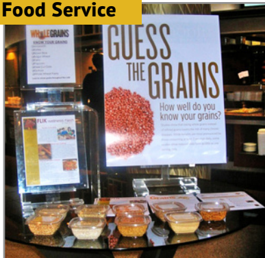
Guess the Grains Sampling Bar Compass NA cafeteria