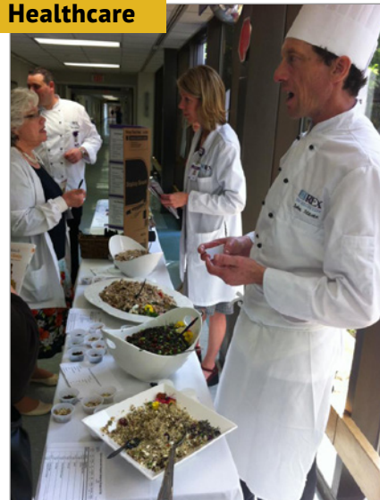
Chef Demo and RD Talk Rex Healthcare