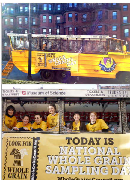
Duck Boat Sample Giveaway Whole Grains Council