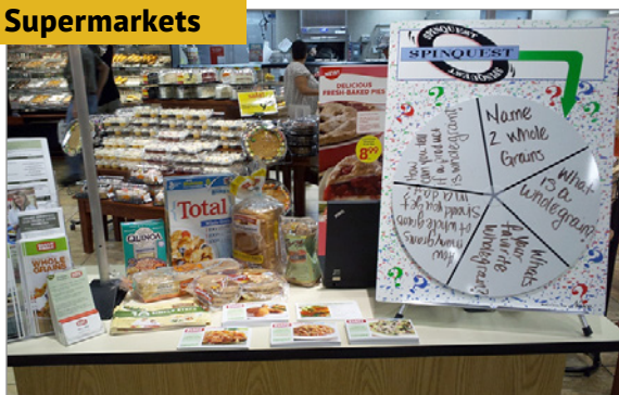
Quiz Game, Whole Grain Prizes Giant Eagle Supermarkets