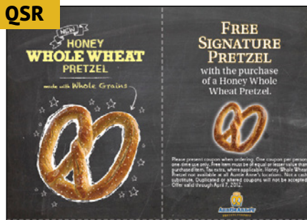
Buy One, Get One Free offer Auntie Anne's