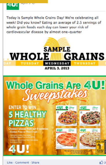
Facebook Sweepstakes Better4U Foods