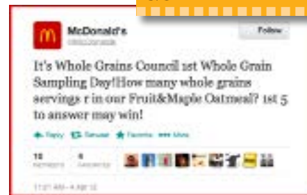
Twitter Giveaway McDonald's