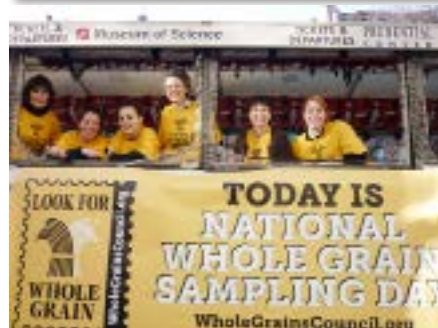
Duck Boat Sample Give-away Whole Grains Council