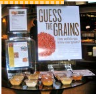
Guess the Grains Sampling Bar Compass NA cafeteria