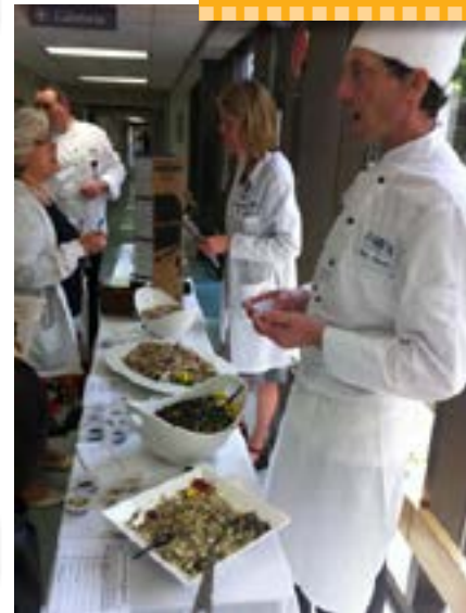
Chef Demo and RD Talk Rex Healthcare