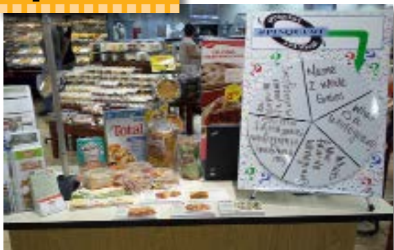
Quiz Game, Whole Grain Prizes Giant Eagle Supermarkets