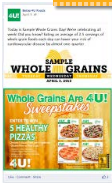
Facebook Sweepstakes Better4U Foods