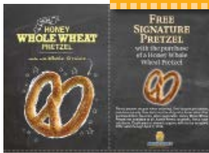
Buy One, Get One Free offer Auntie Anne's