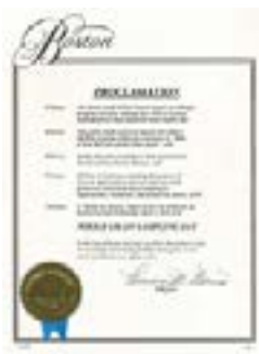
Mayoral Proclamation City of Boston