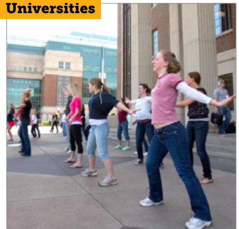
UMN Campus Flash Mob Grains for Health Foundation