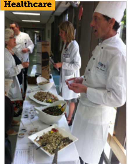
Chef Demo and RD Talk Rex Healthcare