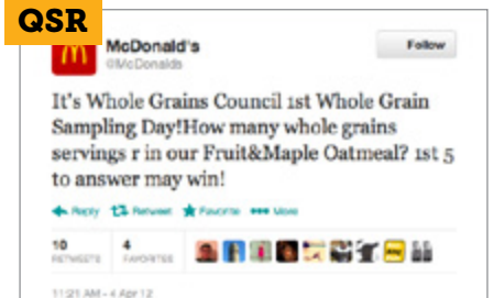
Twitter Giveaway McDonald's