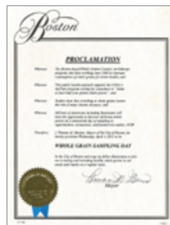
Mayoral Proclamation City of Boston