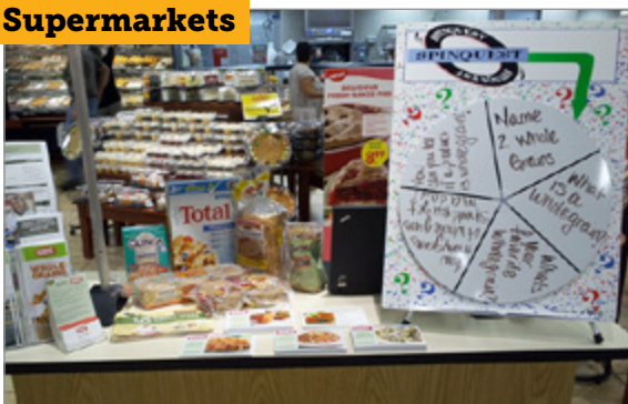
Quiz Game, Whole Grain Prizes Giant Eagle Supermarkets