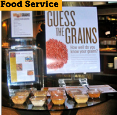
Guess the Grains Sampling Bar Compass NA cafeteria