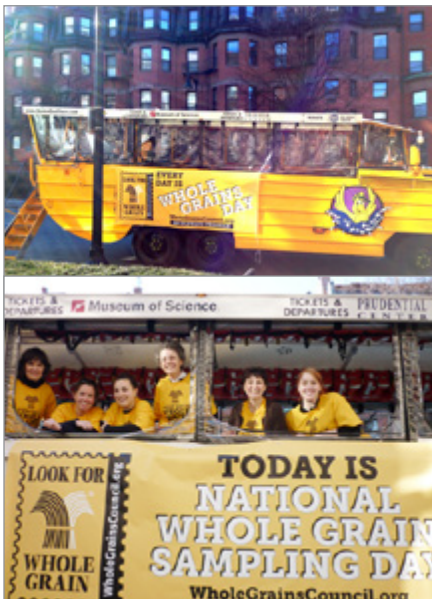
Duck Boat Sample Giveaway Whole Grains Council