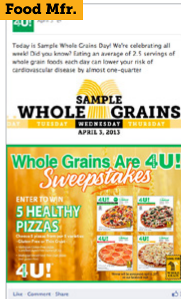
Facebook Sweepstakes Better4U Foods