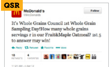
Twitter Giveaway McDonald's