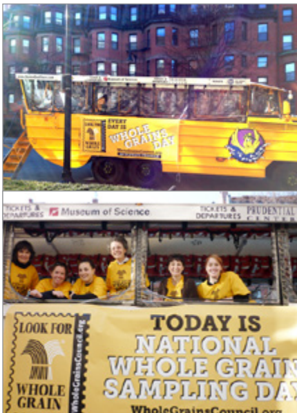
Duck Boat Sample Giveaway Whole Grains Council