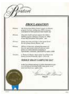
Mayoral Proclamation City of Boston