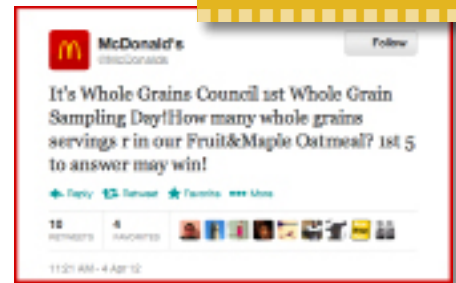
Twitter Giveaway McDonald's