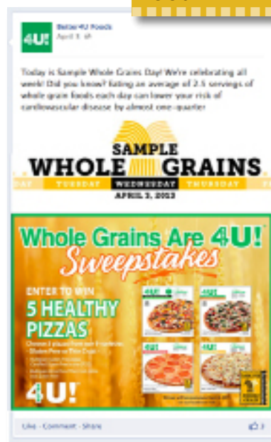
Facebook Sweepstakes Better4U Foods