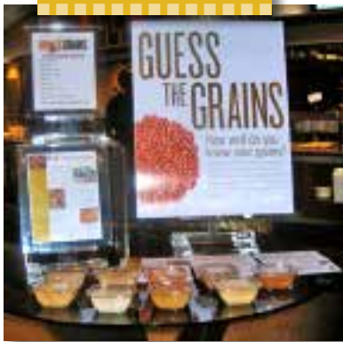
Guess the Grains Sampling Bar Compass NA cafeteria