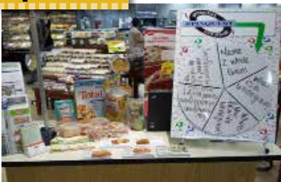
Quiz Game, Whole Grain Prizes Giant Eagle Supermarkets