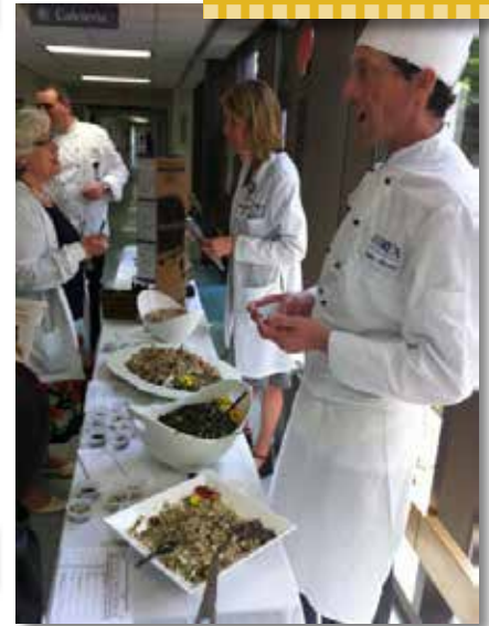
Chef Demo and RD Talk Rex Healthcare