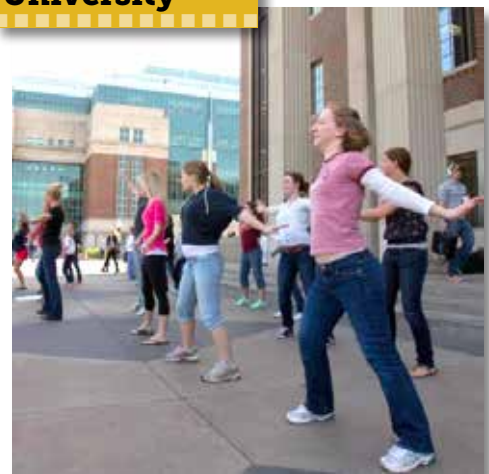
U MN Campus Flash Mob Grains for Health Foundation