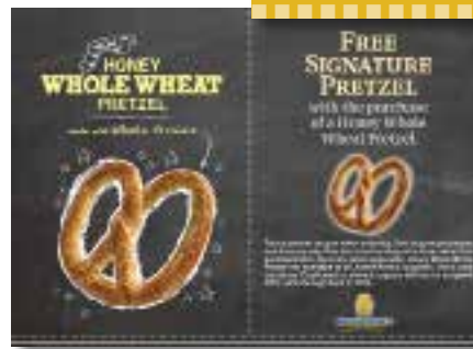
Buy One, Get One Free offer Auntie Anne's